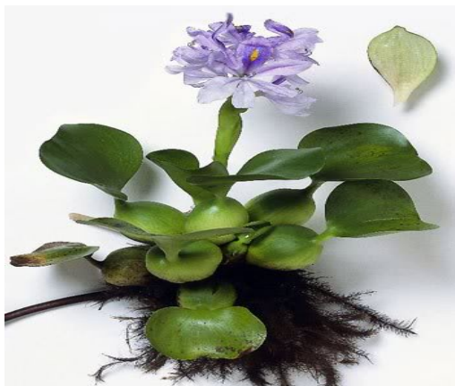
Figure-4. Hyacinth in a Duong Lake.