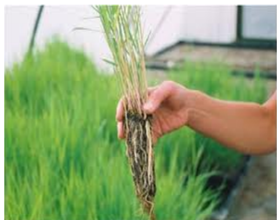
Figure-5. Reed plants ( Phragmites communis ).