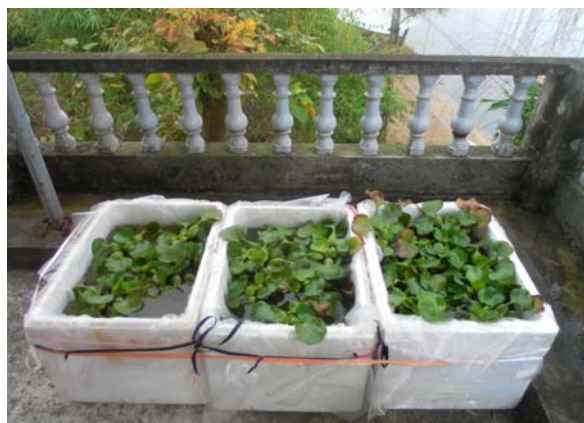
Figure-3. Water treatment experimental pattern by hyacinths.

Lake and island shore water is much more polluted than central water because of the tiny differences in water-in and water-out in term of its amount and velocity. This prevents the contaminants from moving into the central part of the lake.