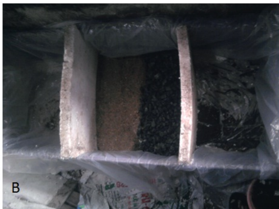
Figure-2. (A and B): Experimental pattern of horizontal filter.