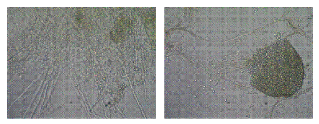
Figure-3. Microorganism that grew in the Neem seed oil (fungi), observed by OLYMPUS CX31 microscope with 400x magnification.

hydrolysis process [7,20]. Several species of fungi capable of producing lipase enzymes are Aspergillus, Humicola, Fusarium, Penicillium, Mucor, Monilia, Oidium, Rhizopus, and Cladosporium [7,19]. In this experiment, fungi on the surface of Neem seed and inside the extracted Neem oil were observed using OLYMPUS CX31 microscope with 400x magnification (Figure-3).