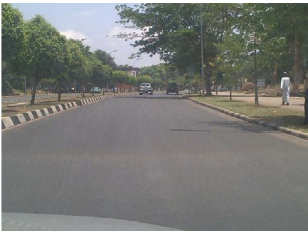
Newly rehabilitated road.