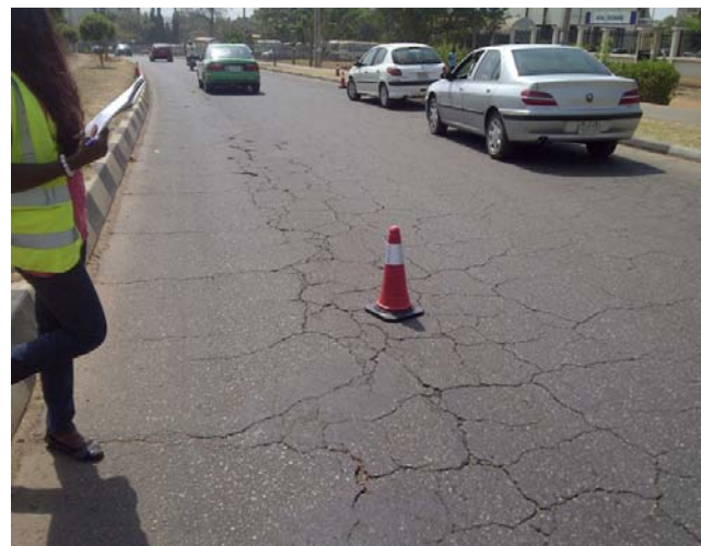
The existing road before rehabilitation.